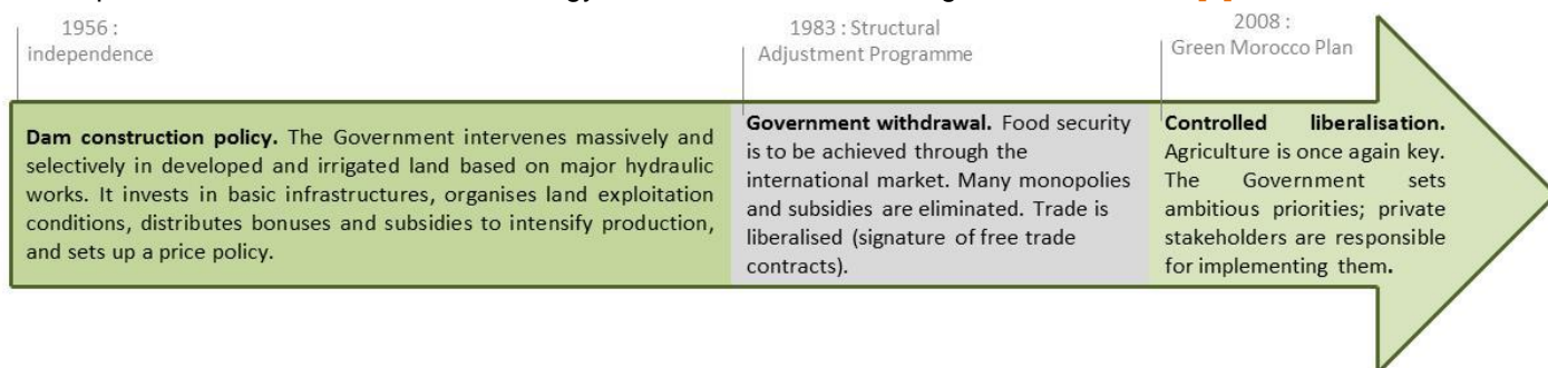
Timeline: Morocco's Agricultural Strategy Since Independence [3]

speed up growth, reduce poverty, ensure that the agricultural sector is sustainable and consolidate its integration in national and global markets. The GMP targets a doubling of agricultural GDP in the space of 10-15 years, the creation of 1.5 million jobs in the sector, and a two- to threefold increase in agricultural incomes [1].